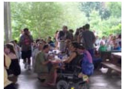
Enjoying each other's company