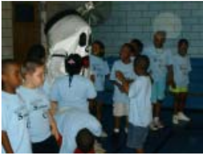
Tobacco staff put on a "Ciggy Butts" show for the campers

TCV Tobacco staff are facilitating a modified Life Skills program to three groups of youth who are ages 9-11 at the UPMC Braddock Health For Life Summer Camp . Children at the camp go on trips to Idewild, the zoo and the wave pool. They make pottery at the Braddock Carnegie Library and have arts and crafts at the base-site, Good Shepherd in Braddock. Other than the typical camp activities, the kids are tutored in reading and math and learn about asthma and nutrition.