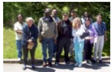
On the wild side, at the zoo

On May 26, 2005, Rankin House Consumers and 4 staff members enjoyed a fun filled day at the Pittsburgh Zoo and Aquarium in Highland Park. All enjoyed a beautiful day outdoors checking out the animals. Everyone had a picnic lunch at the beginning of the trip; then it was off to see the animals! The least popular was the bat exhibit! It was very interesting to see all the different types of animals and aquatic life that nature has to offer. We look forward to going again next year.