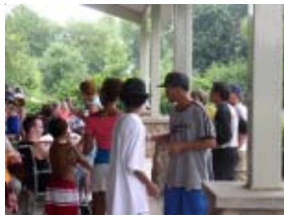
Getting ready to go to the waterpark