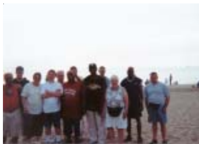
Watching the sunset at Sunset Beach

On June 25, 2005, Brinton Manor consumers set sail for Sea Isle City, New Jersey for a week filled with fun and relaxation. While in Sea Isle City, they walked the boardwalk, played miniature golf and lounged on the beach. Sea Isle City is located in the middle of all of the New Jersey shores so there was a lot to see. Dinner at the Taj Mahal in Atlantic City was exciting. Watching the sunset at Sunset Beach was another memorable attraction. While watching the sunset, they participated in the traditional evening program of playing Taps, God Bless America and the Star Spangled Banner. Next, they moved on to visit Cape May where they did some shopping and site seeing. They visited Ocean City and Stone Harbor. Last, but not least, they really enjoyed Wildwood, where they visited more than once. At Wildwood, they enjoyed shopping, walking on the boardwalk and eating ice cream. All 12 consumers had a great time!