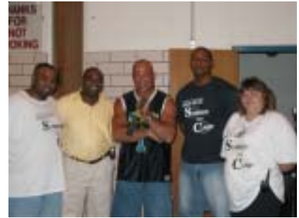
Camp staff with Kurt Angle