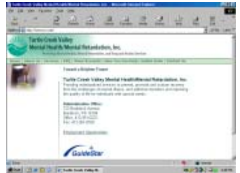
Above: A view of the home page of www.tcv.net

Special thanks to those who helped with the project by proofreading, providing feedback and suggestions for your departments, etc. I hope that if you haven't seen the site yet, that you check it out and enjoy it!