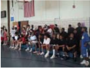
Participants listen to the instructions of the tournament

Kick Butts Day is a national initiative to make kids leaders in the effort to stop tobacco use. To support or join the project call 412-464-1522.