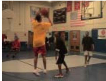
The players take the court for the championship game in the 13-15 division