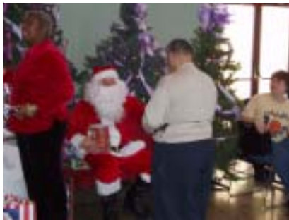
Santa passing out presents