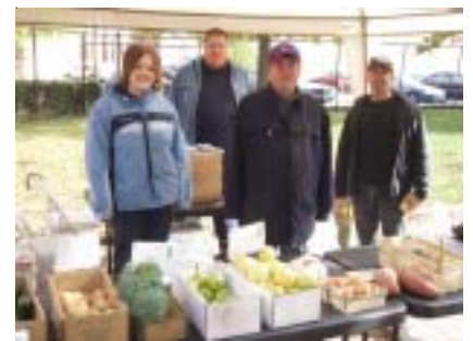
Farm stand volunteers