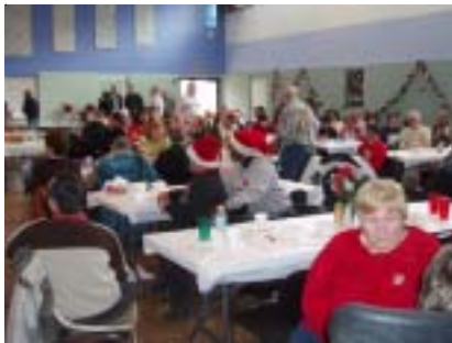
Christmas party attendees

The Steel Valley and New Beginnings (St. Roberts) ATFs invited staff and consumers to join them at their Annual Christmas Party on Thursday December 22 nd from 11 am – 2pm. All enjoyed the fun and festivities. The event was catered by Conrad's and included a variety of food and goodies. Santa came on his sleigh to give all individuals in attendance presents. Everyone had a great time singing Christmas Carols. Thank you to the very talented family member who played the piano for everyone to sing along.